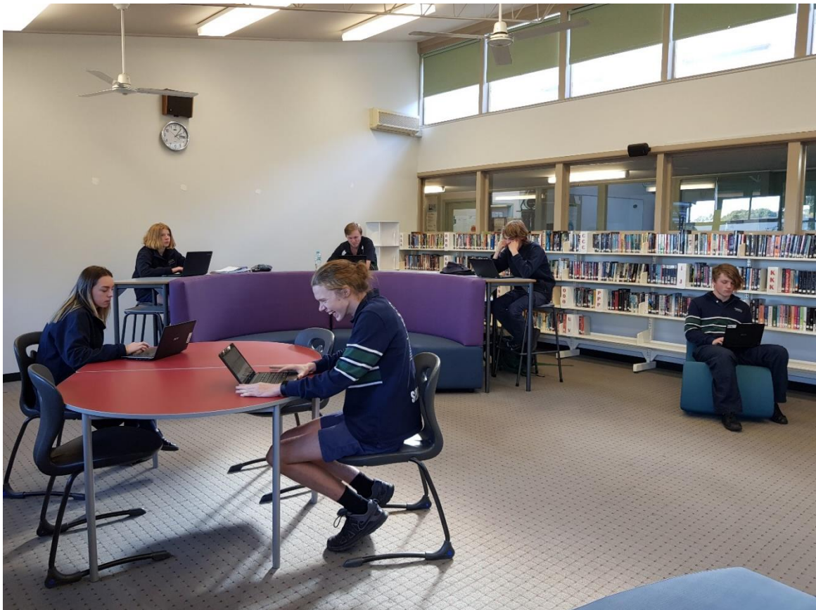
The returning Yr 11 & 12's following safe distancing in the newly refurbished Resource Centre